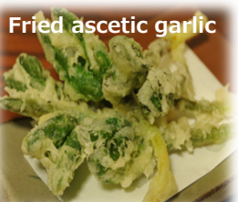
Fried ascetic garlic