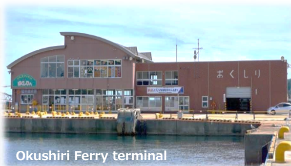
Okushiri Ferry terminal