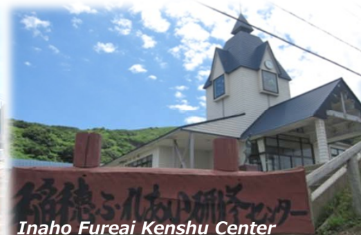
Inaho Fureai Kenshu Center