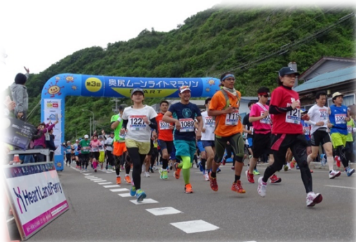
Okushiri moonlight marathon