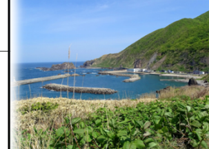
Kamuiwaki fishing port