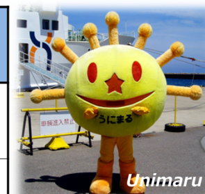
Kitaoui misaki park