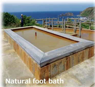
Natural foot bath