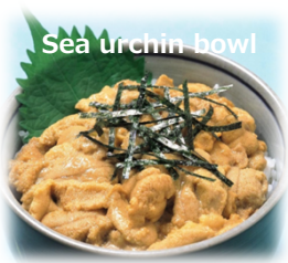
Sea urchin bowl