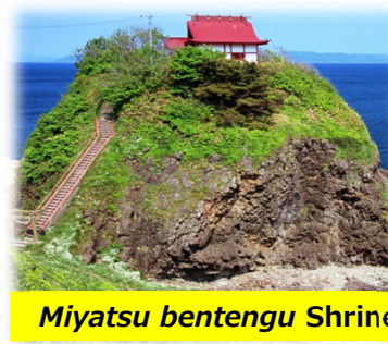
Miyatsu bentengu Shrine