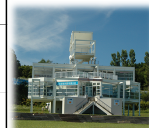
Yoshinori Sato Baseball Museum