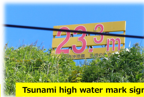
Tsunami high water mark sign