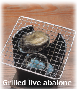
Grilled live abalone