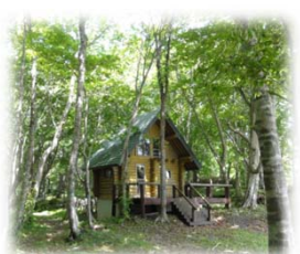
Beech tree forests