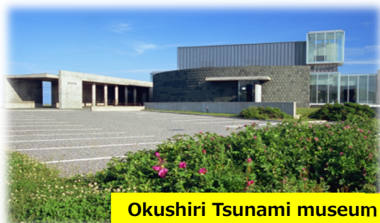
Okushiri Tsunami museum