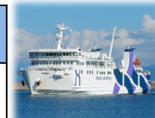
M/V Calanthe Okushiri