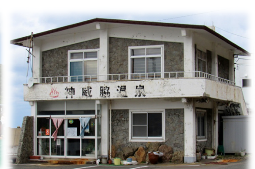
Kamuiwaki hot spring